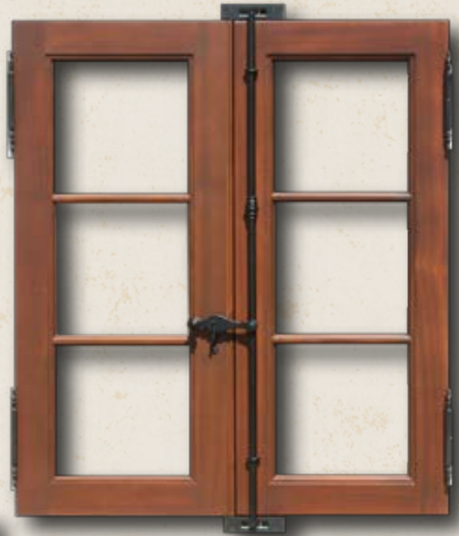
Inswing Casement, SDL, Impact Rated, Cremone Bolt