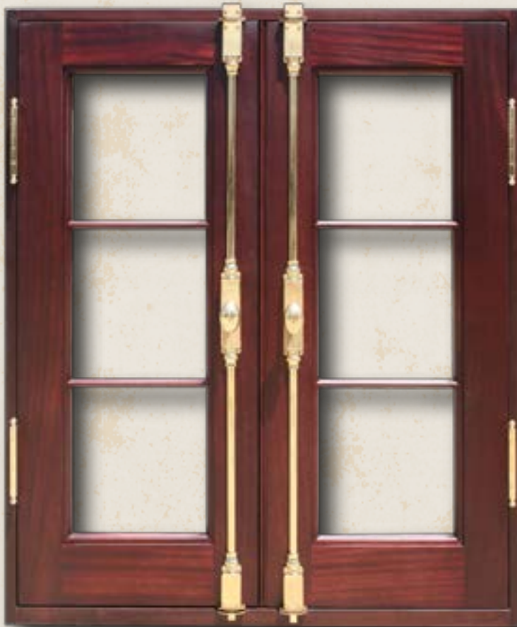
Inswing Casement, SDL, Impact Rated