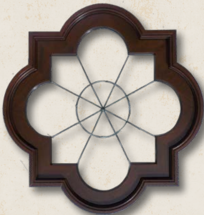
Barbed Quatrefoil, SDL, Impact Rated