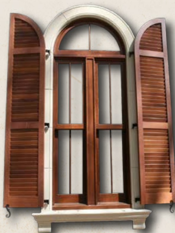
Double hung, SDL, Impact Rated, Shutters and round Transom