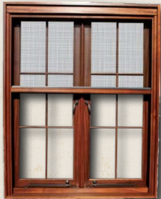
Outswing Casement with roll up screen