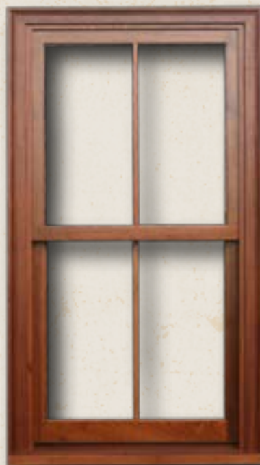
Double Hung, SDL, Impact Rated