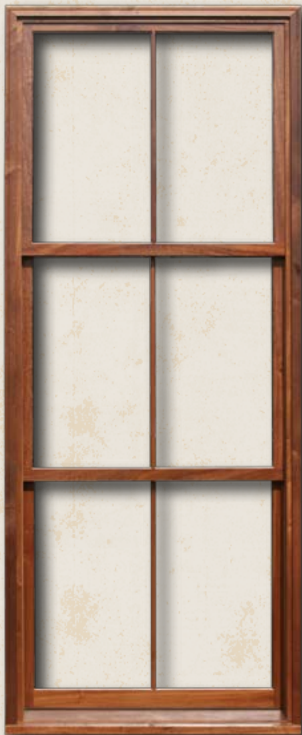
Triple Hung, SDL Impact Rated