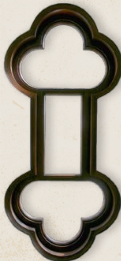
Architectural Shape, SDL