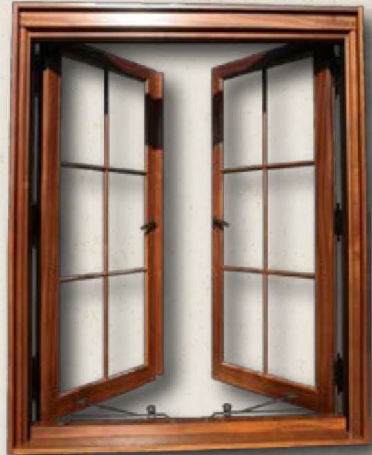
Outswing Casement dbl window SDL Impact Rated